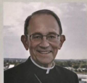
BISHOP LAWRENCE PERSICO

$20/Adult $15/Group of 8 or More $5/High School Student